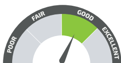
IMPACT AO RESISTANCE