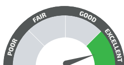
IMPACT AO RESISTANCE